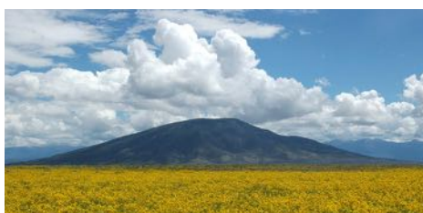
Cerro del Yuta Wilderness, New Mexico