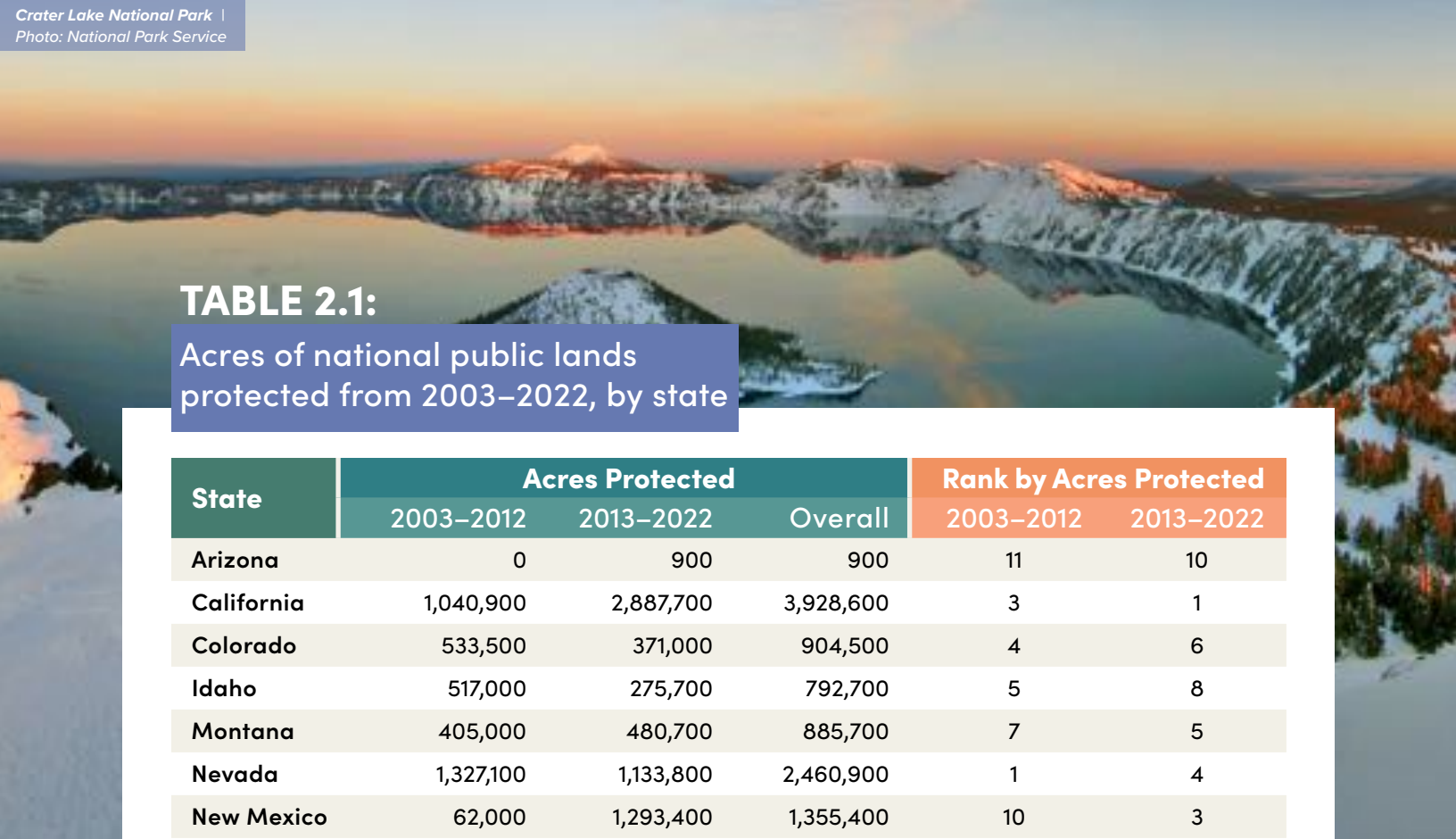
TABLE 2.1: Acres of national public lands protected from 2003–2022, by state