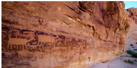
Gold Butte National Monument, Nevada

Though its elected leaders have been outspoken opponents of conservation—and Utah is currently pursuing litigation to eliminate Bears Ears National Monument—the Utah Office of Tourism has leveraged Bears Ears National Monument and other conserved public lands into a highly effective tourism campaign.