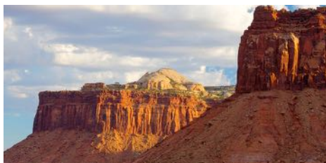
Bears Ears National Monument, Utah