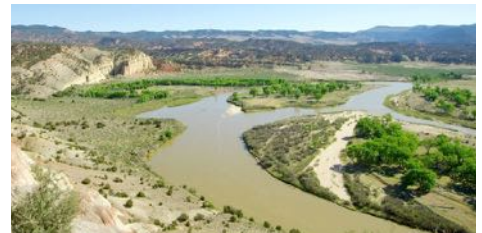
John Wesley Powell National Conservation Area, Utah