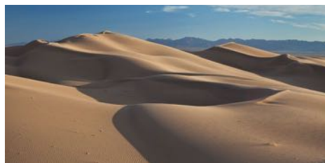
Mojave Trails National Monument, California