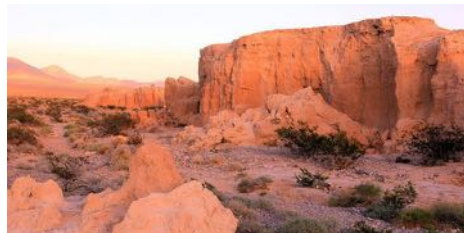
Tule Springs Fossil Beds National Monument, Nevada