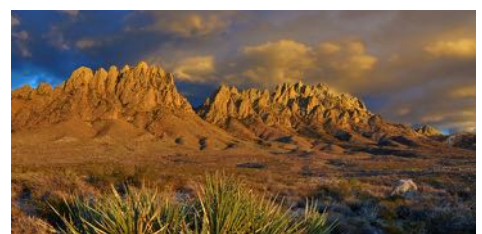
Organ Mountains-Desert Peaks, New Mexico