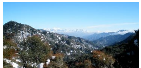
San Gabriel Mountains National Monument, California