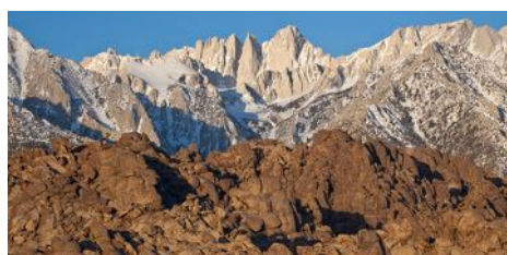
Alabama Hills National Scenic Area, California