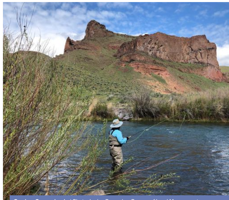
Owyhee Canyonlands

Oregon's leaders and the president also have an immediate opportunity to partner with local communities, hunters, and other important stakeholders to fulfill President Franklin D. Roosevelt's vision to permanently safeguard the greater Hart-Sheldon landscape in southern Oregon. Connecting the Hart Mountain National Antelope Refuge in Oregon and the Sheldon National Wildlife Refuge in Nevada would protect a critical sagebrush-steppe ecosystem and support the survival of pronghorn and other wildlife.