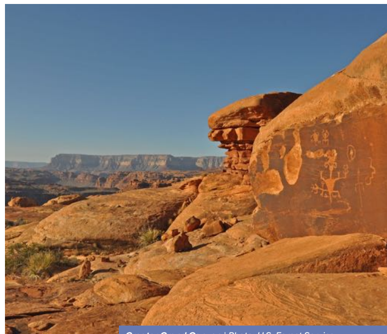
Greater Grand Canyon

A bill sponsored by both of Arizona's U.S. Senators, Kyrsten Sinema and Mark Kelly, alongside Representatives Raúl Grijalva, Ruben Gallego, Ann Kirkpatrick, Greg Stanton, and Tom O'Halleran, is languishing in Congress. The legislation had passed the U.S. House of Representatives in 2019 with bipartisan support but was never even considered by the Senate.